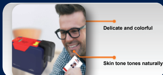
High quality photo processing by Dye sublimation technology

Dual interface card encoding module Contactless ID Card encoding module UHF chip card encoding module Magnetic stripe card encoding module